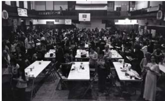
April 12, 1975 - CANE 2nd Anniversary Dinner, Buddhist Church of SF